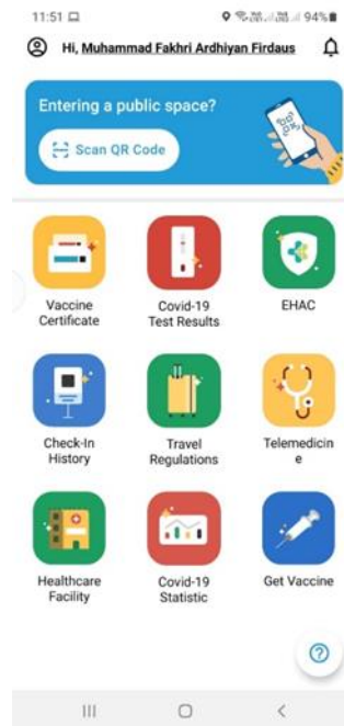
Figure 1. The PeduliLindungi application