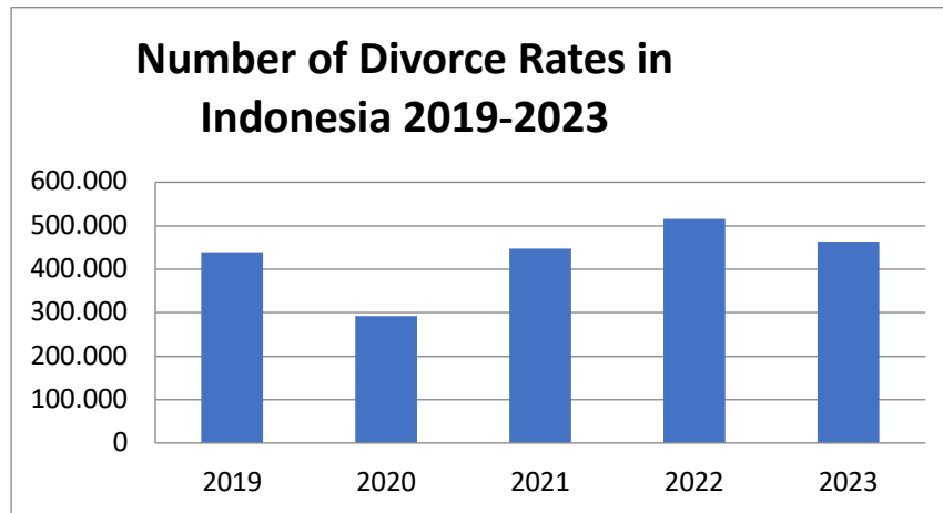
Figure 1. Total Divorce Rate in Indonesia in 2019-2023

province in 2023 occurred in West Java, with 102,280 cases, in addition to East Java and Central Java, with 88,213 and 76,367 cases, respectively. More details can be seen in the table of divorce rates in Indonesia, as follows.