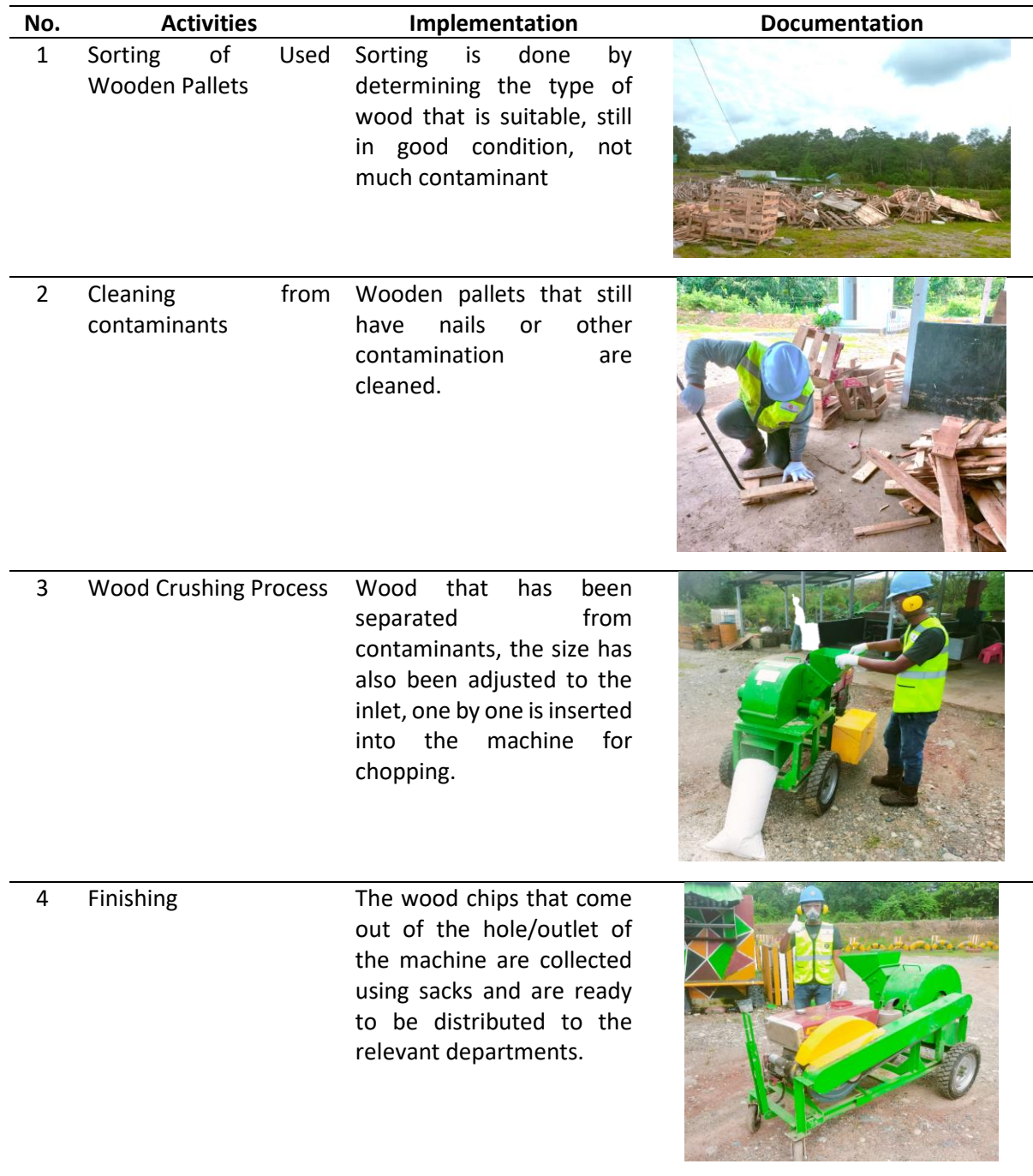
Table 1. PT AMM Jobsite Mifa Bersaudara wood pallet solid waste processing activities

This activity starts from the stage of collecting wood pallet waste from the partners to PT AMM site Mifa Bersaudara; determining the tools to be used for recycling; selecting the appropriate wood pallet raw materials and the final process is the packaging of processed used wood pallets that have become powder, which are then used as follows.