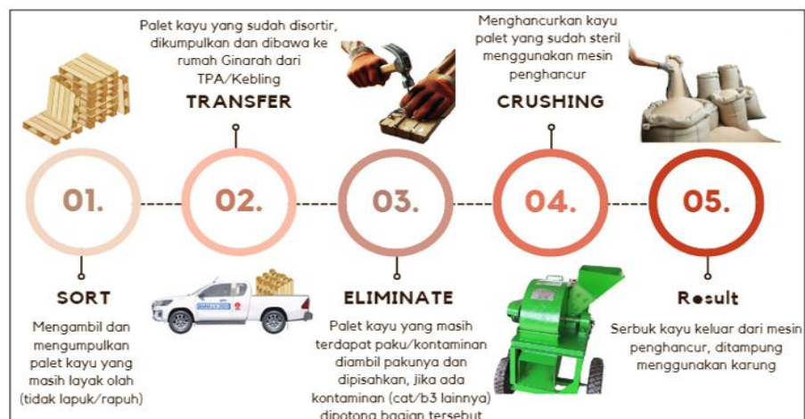
Figure 1. Flowchart of wood pallet waste processing.

The steps of this research are first to identify problems, analyze the impact of problems, set goals, analyze the cause and effect of the root of the problem, determine solutions, make improvement plans, prepare the resources needed, implement plans and measure data, evaluate and analyze the achievement of goals.