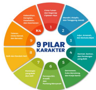
Figure 4. The Nine Pillars of Character

A set of attitudes, behaviors, motivations, and skills refer to character. A person's character is formed because of the habits that are done, the attitude taken in considering the situation, and the words spoken to others. Character education requires habits. Characters do not form instantly and must be trained seriously and proportionately to achieve the desired shape and strength.