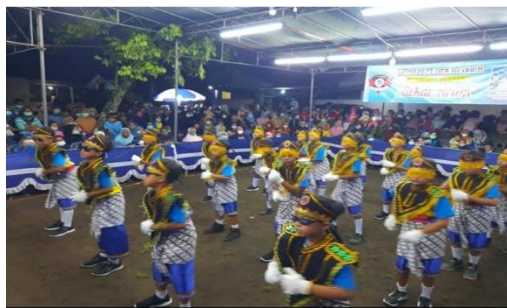
Figure 2. The Art of Kubro Siswo

According to Joko Sutarso (2012: 507), Local wisdom is closely related to the values of life embraced by a community, such as the value of mutual cooperation. In practice, the implementation of the kubro siswo performance indirectly requires the performers to uphold the spirit of togetherness and cooperation, in order to create an interesting and successful performance.