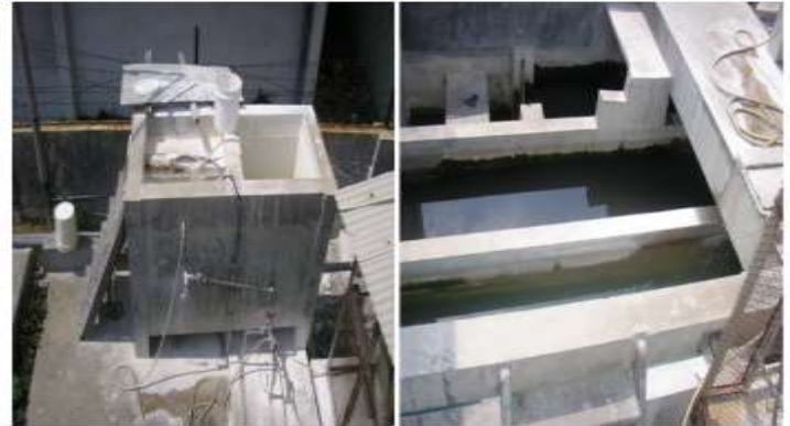
Figure 4. Example of Khlorine Contactor Body for disinfection process